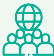
Medical Goods and Services